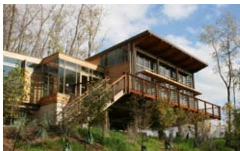
The Reflection Center

Earlier this month, the Reflection Center received LEED® (Leadership in Energy and Environmental Design) Green Building Rating System Gold certification from the U.S. Green Building Council. The building, which will be dedicated next Friday afternoon, joins the Janet Prindle Institute for Ethics, which became the state's first LEED-New Construction Gold building last spring. ■